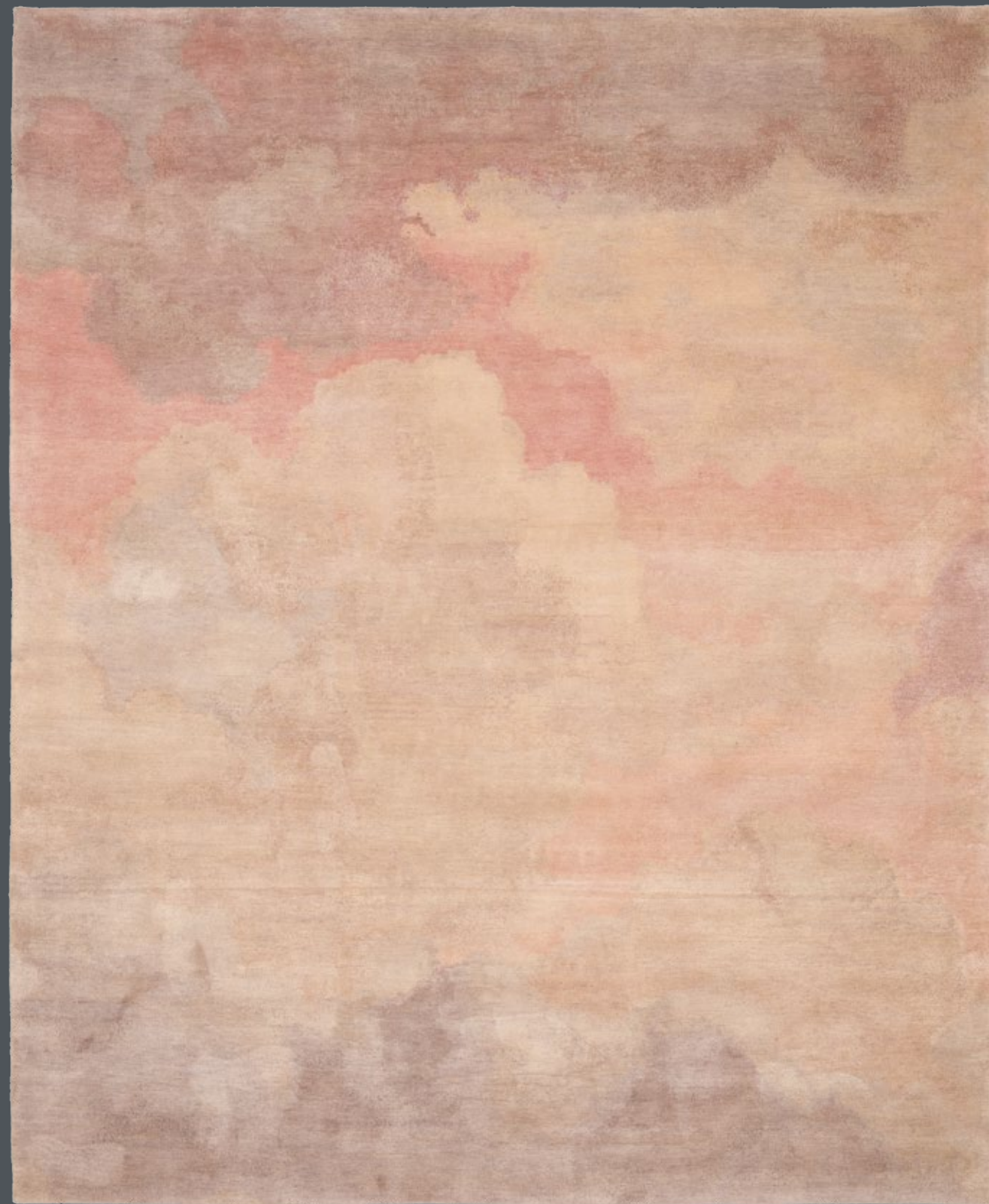
CLOUD 1 DARK PINK