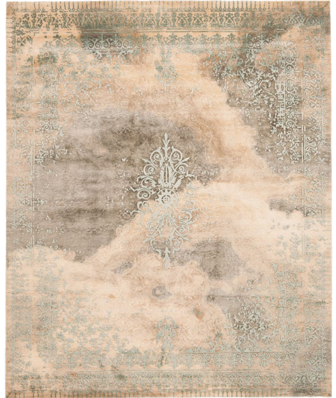
FERRARA CLOUD 2 SPECIAL ROCKED - D 030 SSW UP