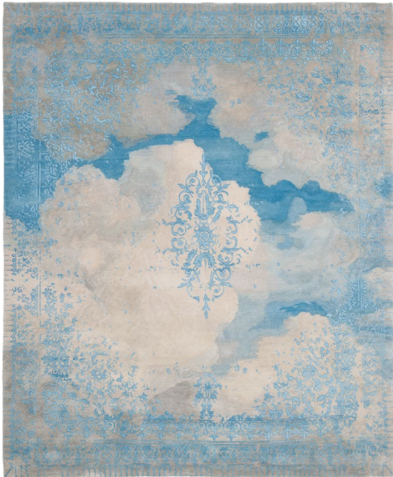
FERRARA CLOUD 1 SPECIAL ROCKED - BI 06 SSW UP