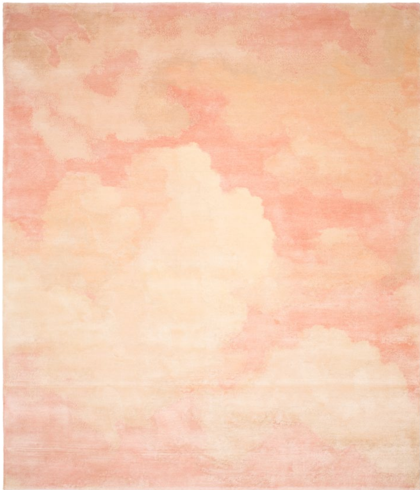
CLOUD 1 PINK