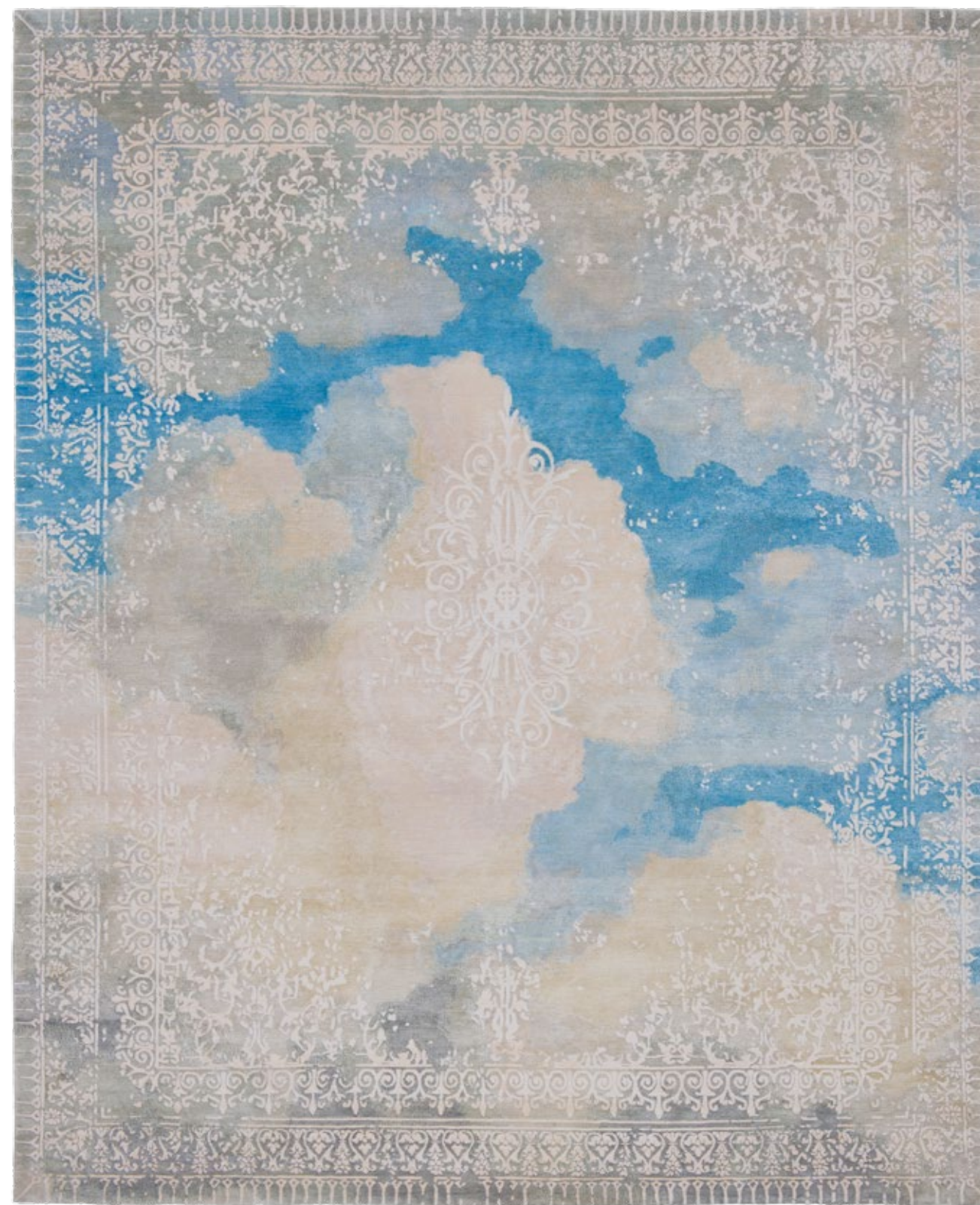
FERRARA CLOUD 1 SPECIAL ROCKED - AD 12 SSW UP